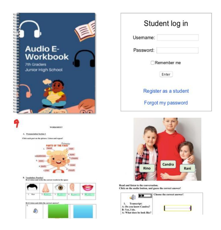
Figure 1. The layout of Audio E-Workbook